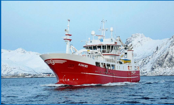
SANDER ANDRE, NORDHAVET & GUNNAR K.

Yard Larsnes Mek. V. A/S. Y.no. 58, 59, 60 Gearbox G50FKV Propeller P65.22.260.4 Engine 1370 kW-900rpm