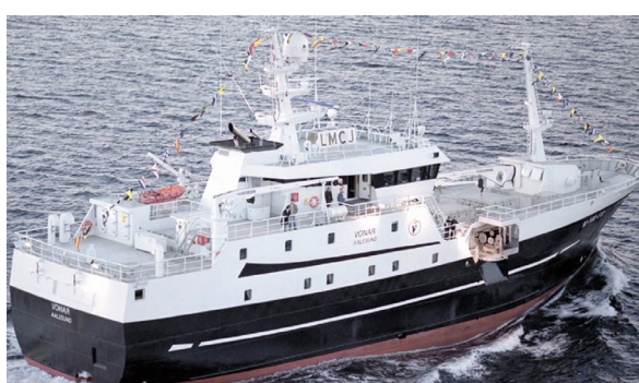
VONAR Yard Larsnes Mek. Verksted AS Gearbox G60FK Propeller P70.23.280.4 – ICE C Engine 1324 kW-1000rpm