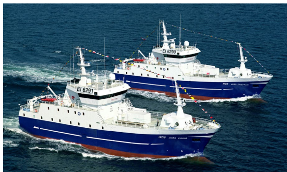
AVRO CHIEFTAIN & AVRO VIKING Yard UMOE Sterkoder AS. Gearbox G50F Propeller P70.23.260.4 – ICE C Engine 1 650 kW-1000rpm.