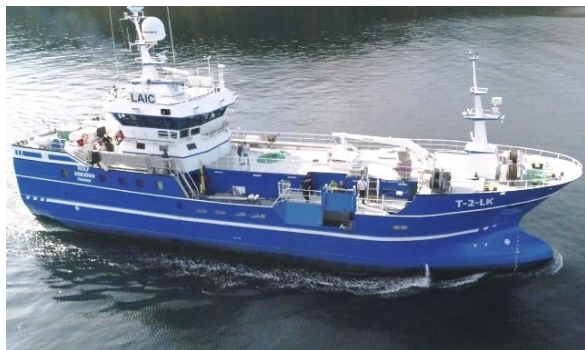
ROLF ASBJØRN Yard Tersan Y.no. 1052 Gearbox G50F Propeller P58.19.230.4 Engine 746kW-1800rpm