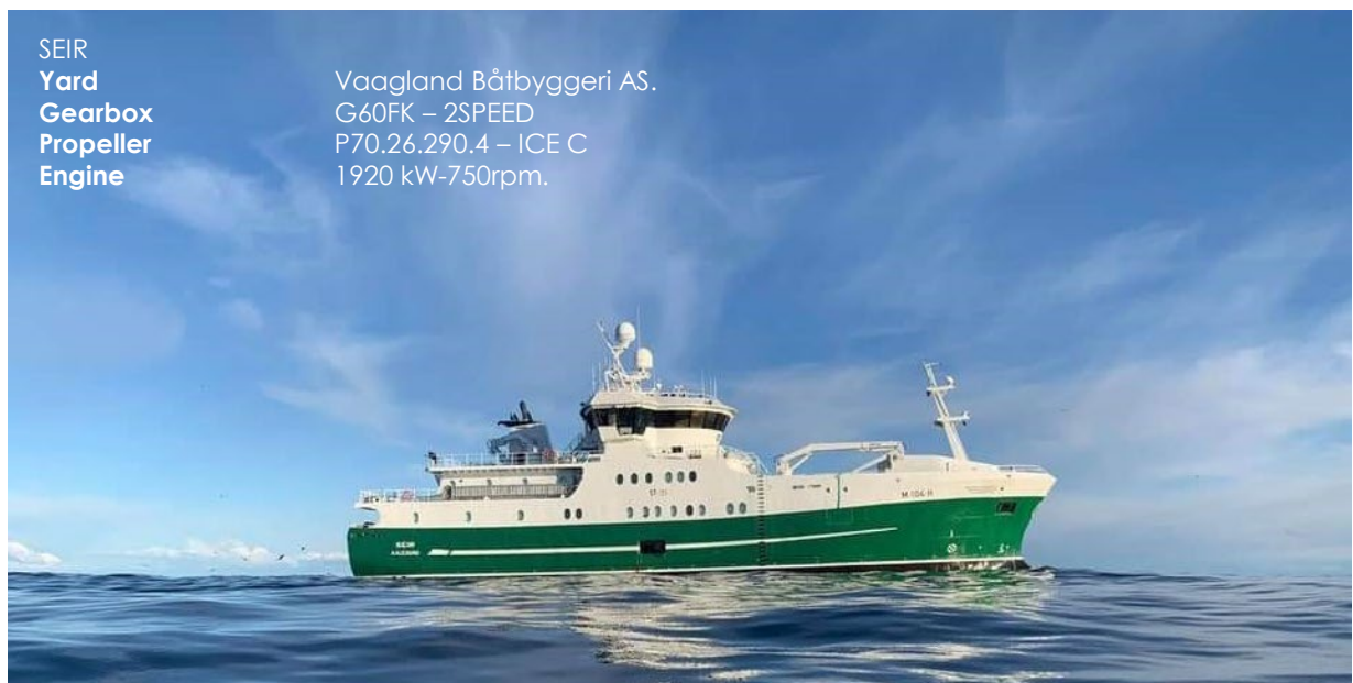
SEIR Yard Vaagland Båtbyggeri AS. Gearbox G60FK – 2SPEED Propeller P70.26.290.4 – ICE C Engine 1920 kW-750rpm.