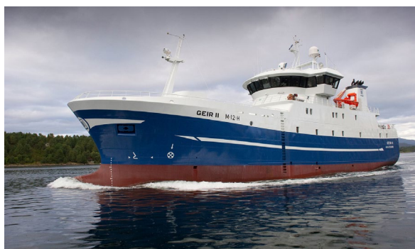
GEIR II Yard Fiskerstrand V. AS Gearbox G60F Propeller P70.24.270.4 – ICE C E-motor 1800 kW-1200rpm.