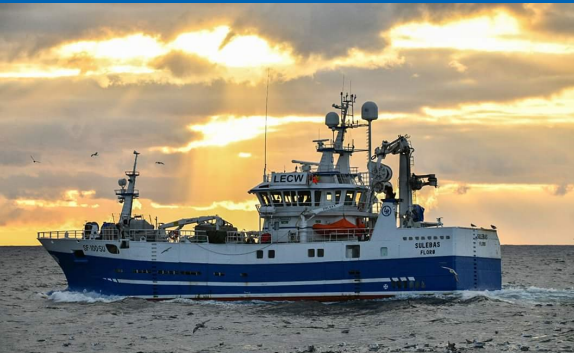
SULEBAS & VESTERHAV

Yard Solund Verft, Y.no. 6 - 7 Gearbox G50FK Propeller P70.22.280.4 Engine 1326 kW-1000 rpm