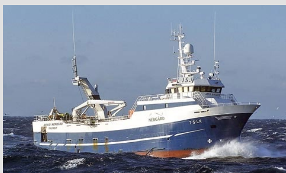
ARVID NERGÅRD & OLE KRISTIAN NERGÅRD

Yard ASTANDER Shipyard Gearbox 2 x G60FK Propeller 2 x P85.26.290.4 Engine 2 x 2640kW-750rpm